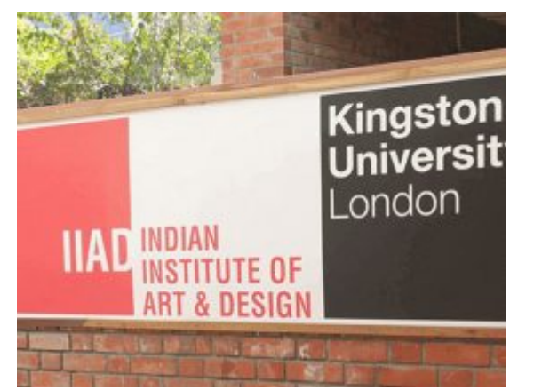
Indian Institute of Art and Design (IIAD) Invites Applications for Admission 2021

Toppr Partners with NDMC to Educate Underprivileged Students Through Its Flagship Program Asha