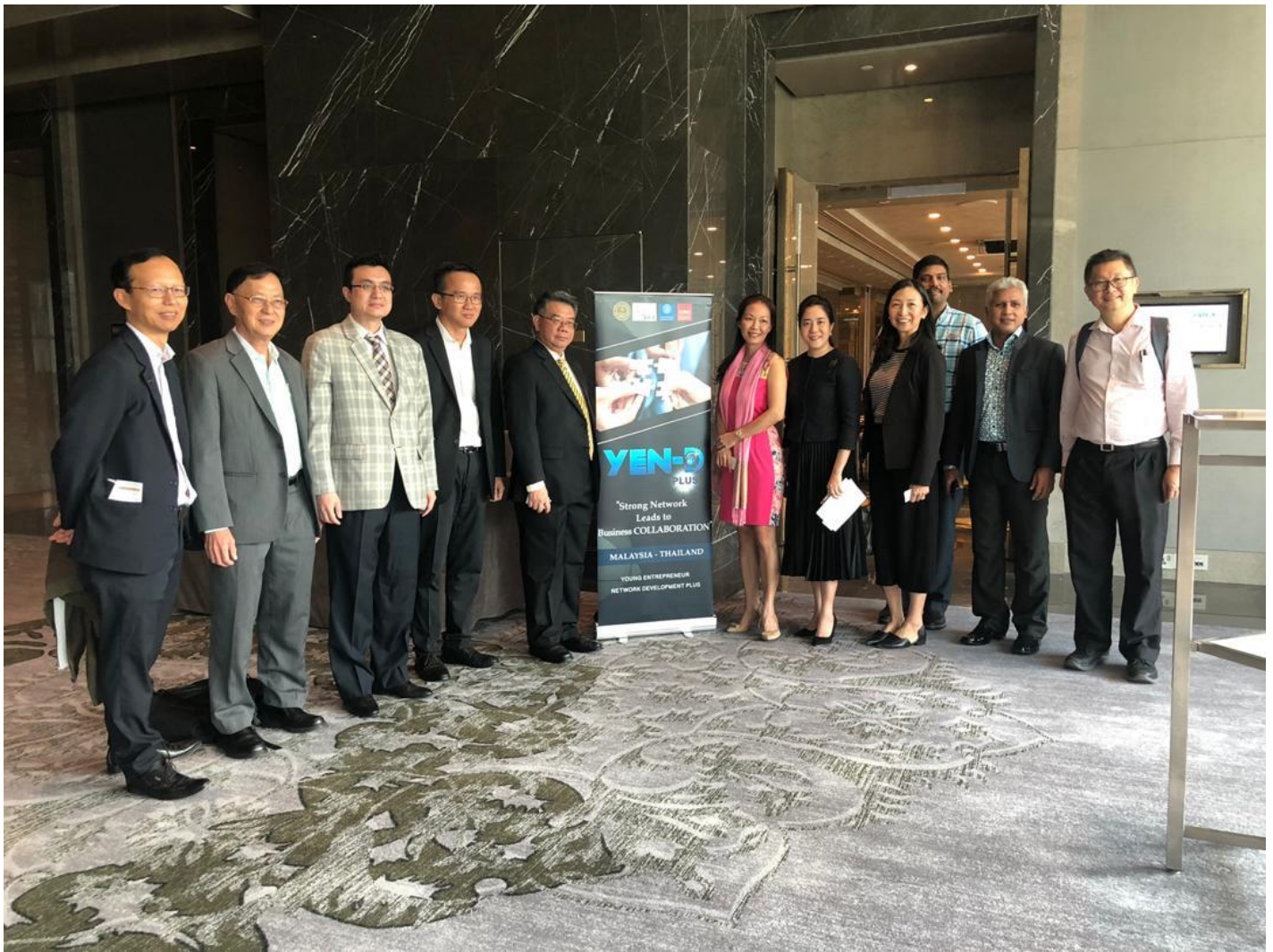
Treasure Advisory Business Loan SME Loan Expert