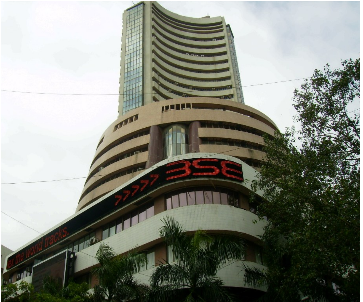
Bombay Stock Exchange